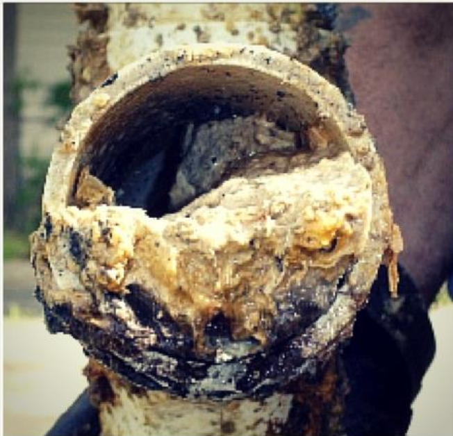
The sewer pipe (above) is blocked by grease buildup.

Blocked pipes can cause raw sewage to back up into homes and businesses, and it is difficult and expensive to fix.